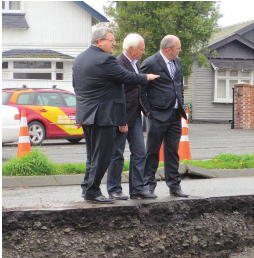
Earthquake Recovery Minister, the Hon. Gerry Brownlee, Christchurch Mayor Bob Parker, and Transport Minister, the Hon. Steven Joyce, inspect damaged infrastructure.

Roading New Zealand (RNZ), which represents contracting companies involved in building transport infrastructure and has members involved in the rebuild, welcomes the formation of the alliance. "We look forward to